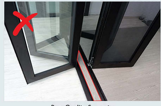
Poor Quality, Seperate Door and Mesh Door