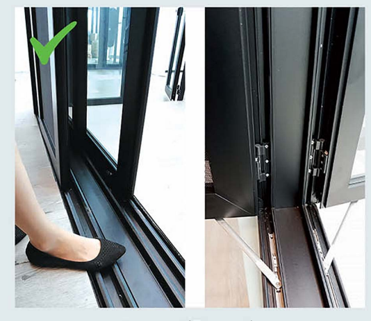
Integrated Door and Mesh Door System without Gap.