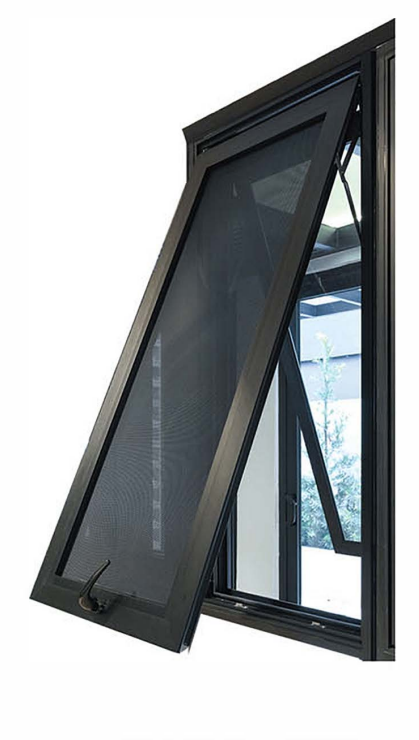
TOP HUNG MESH