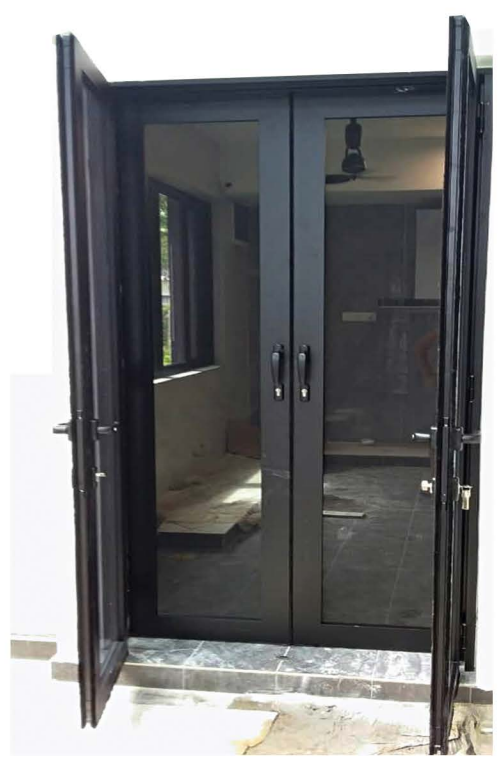
MultiSwing Door Mesh Door