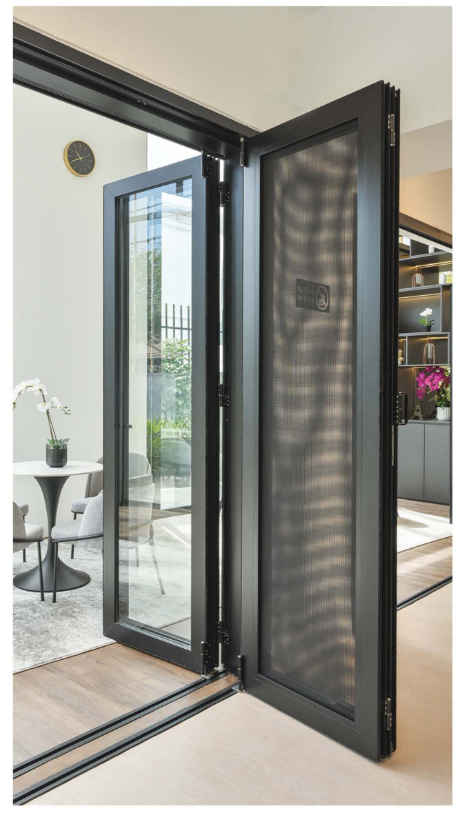
FOLDING MESH DOOR