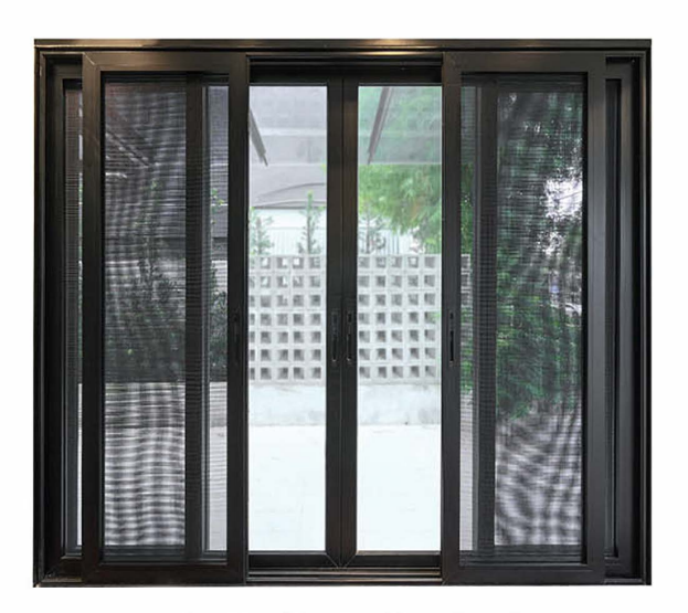
SLIDING DOOR MESH