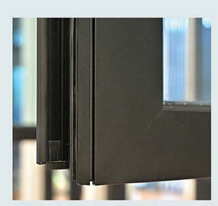
75mm Frame Profile