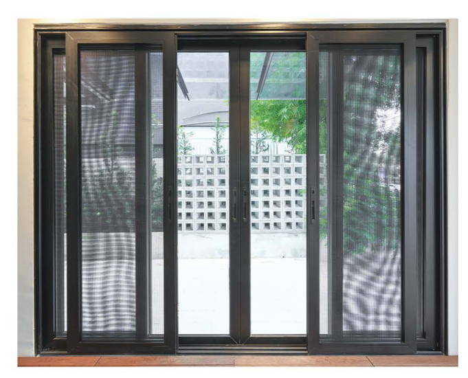
Sliding Door Mesh + Sliding Glass Door