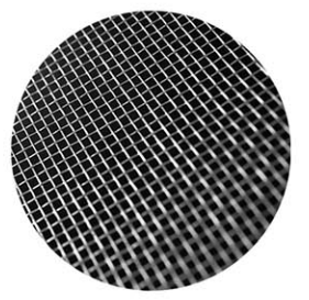
SUS 304 MESH