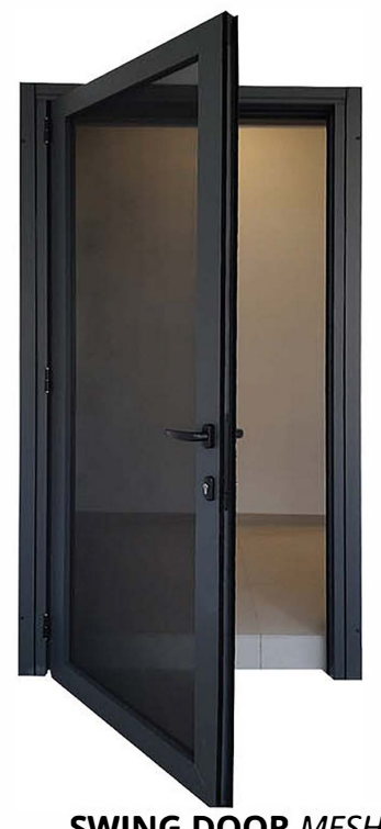
SWING DOOR MESH