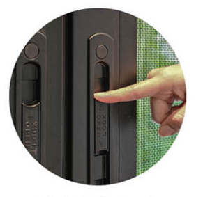
MultiPoint Lock SUS304 Stainless Steel