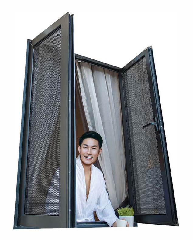
CASEMENT WINDOW MESH