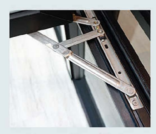
Support Bar Hinge SUS304 Stainless Steel