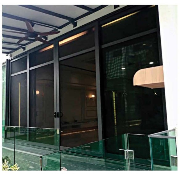
MultiSliding Door Mesh Door