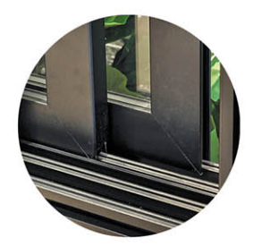
Anti-Lift Track System