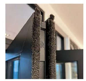
MoHair Weather Strip