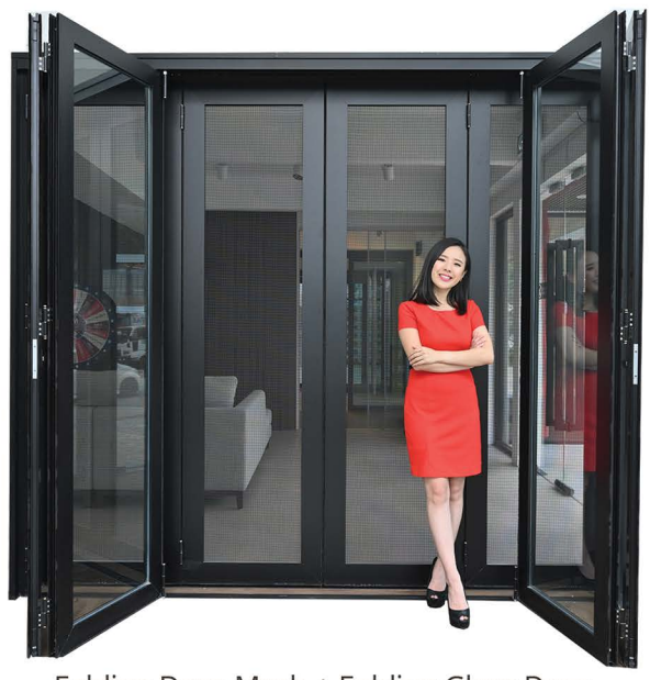
Folding Door Mesh + Folding Glass Door