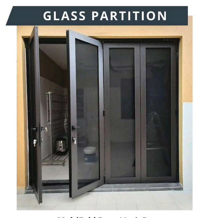
MultiFold Door Mesh Door