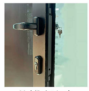
MultiPoint Lock SUS304 Stainless Steel